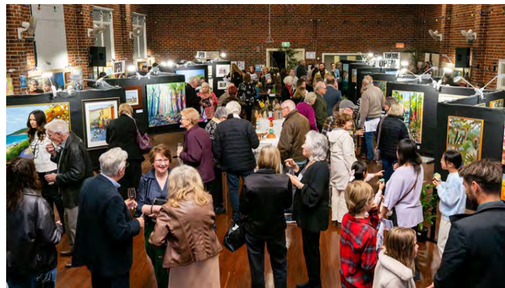
Dardanup Art Spectacular Friday Night Opening