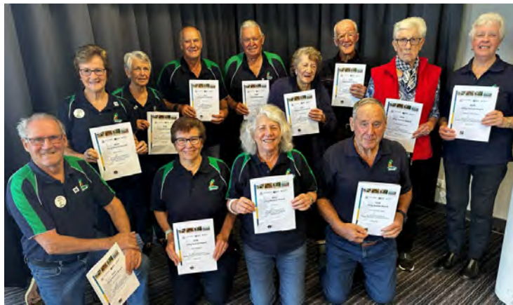
Members of CBF with their 20 and 30 year Service Awards