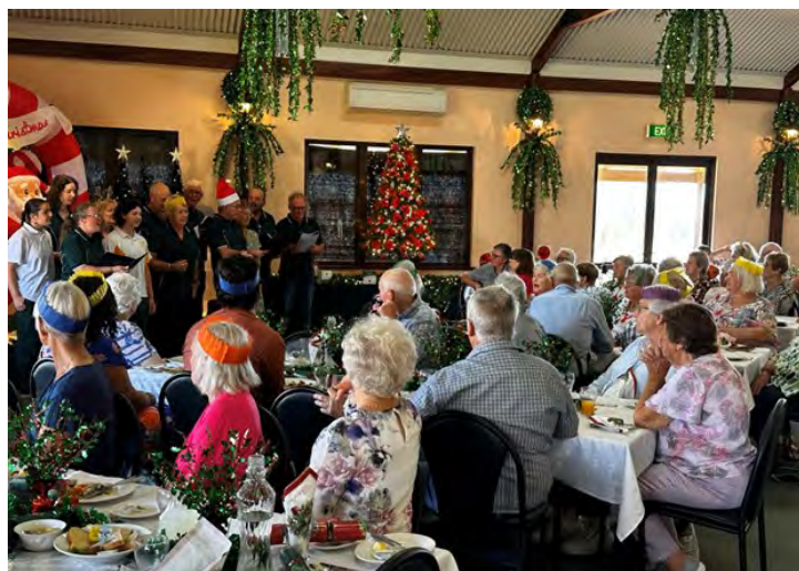
Dardanup Community Choir Performing at the Dardanup Seniors Xmas Lunch Held at the Dardanup Heritage Park