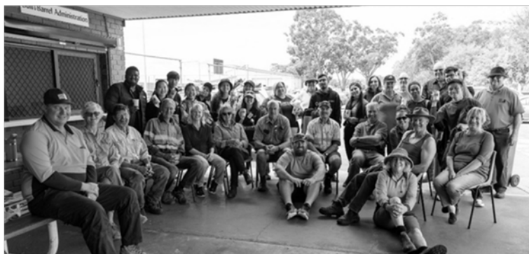
Volunteers In Action - Bull and Barrel Cleanup Mob