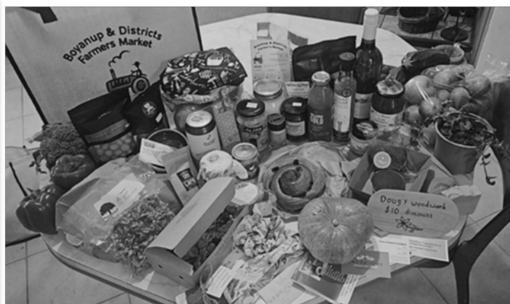
What a Raffle Prize!

E: thebeardedbloke@outlook.com.au W: www.thebeardedbloke.com.au