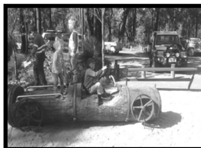
Children playing on the "Flintstone Car" in the playground