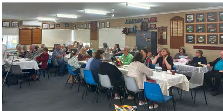
Dardanup Community Enjoying the Morning Tea