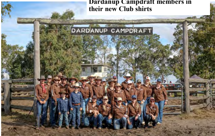
Dardanup Campdraft members in their new Club shirts

What made for some great campdrafting was the fantastic weather, amazing cattle supplied by our ever-reliable local farmers and some personal goal kicking by the competitors. Thanks to Hygain, 4CYTE and Virbac for their donations of great products to share between the place getters. Something a little different this year, Beta Spuds gave us 16kg bags of spuds for the TCO winners.