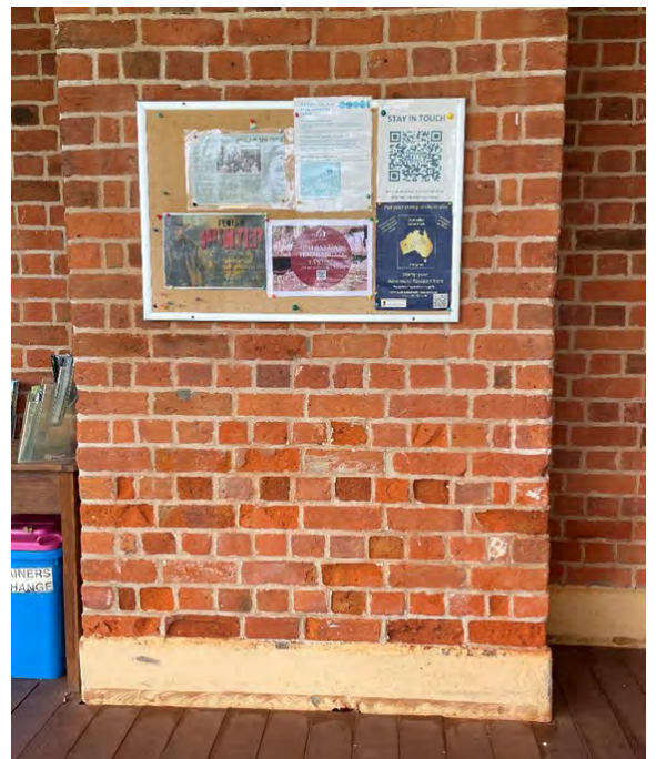
An Exterior Wall of the Old State School