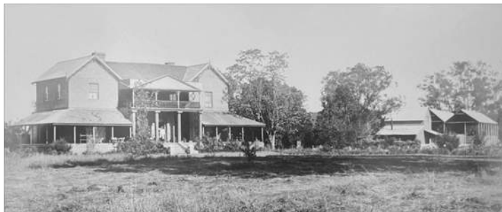
1899 Photo of Dardanup Park which is featured in the Homesteads and Houses section of the DHC website 1899 Photo of Dardanup Park which is featured in the Homesteads and Houses section of the DHC website

Please feel free to attend any of our monthly meetings. Details in the Whats On.