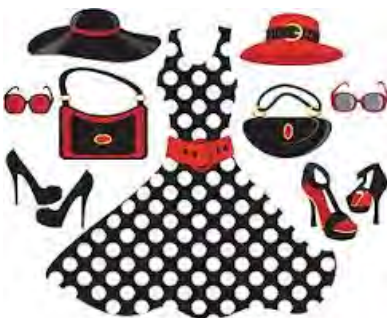
Our Fabulous Team Of Models