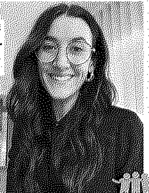
Celebration Homes South-West