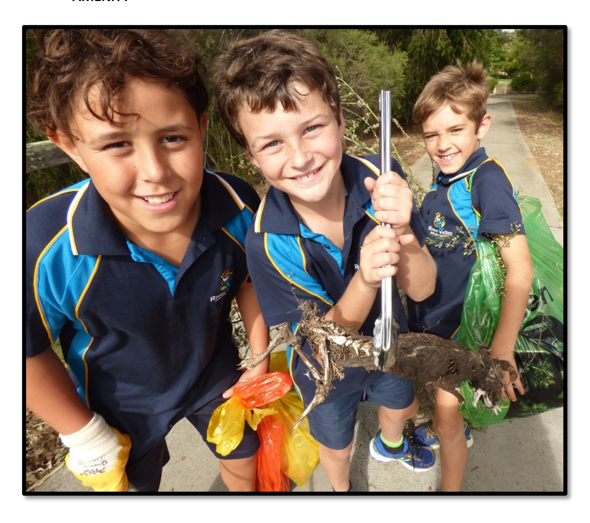
BUREKUP PRIMARY STUDENTS IN THEIR COMMUNITY