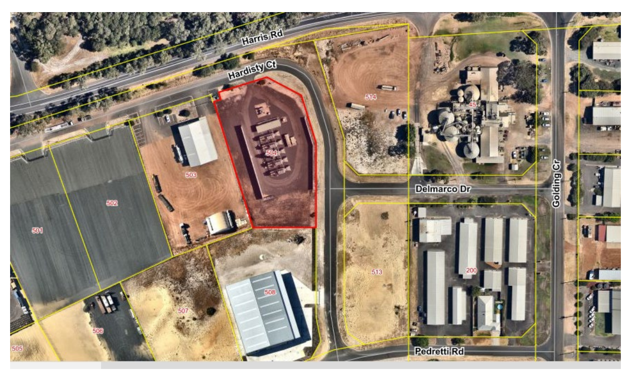
Lot 504 (5) Hardisty Court, Picton east

A plan showing the location of the subject site and its surrounds is contained in Figure 1 of the applicant's Development Application report, as at (Appendix ORD: 12.2.2B) and can be seen below: