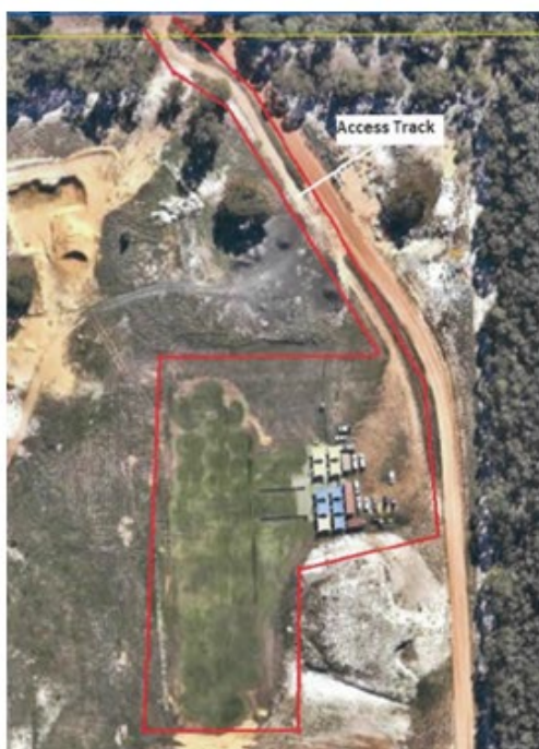
Current lease area shown in red

The Dardanup Aeromodellers Society Inc. (DAMS) previously held a five year lease over a portion of the unused portion of the Shire sand and gravel pit site at Lot 80 Panizza Road, Crooked Brook with the current lease expiring on the 4 th of June 2023. DAMS have requested a renewed lease for a further 10 year period (Appendix ORD: 12.4.4A). They have also requested that Council consider extending the lease area to the west, as shown in yellow below to establish a cross strip to facilitate flying activities on days with significant wind from the east or west.