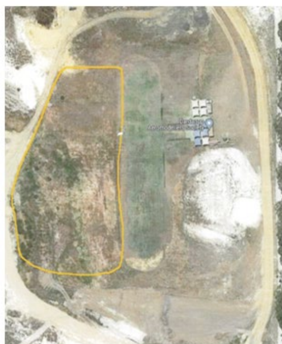
Requested extension area shown in yellow;

Development of this strip would involve establishing a smooth flat grassed area similar to the current strip.