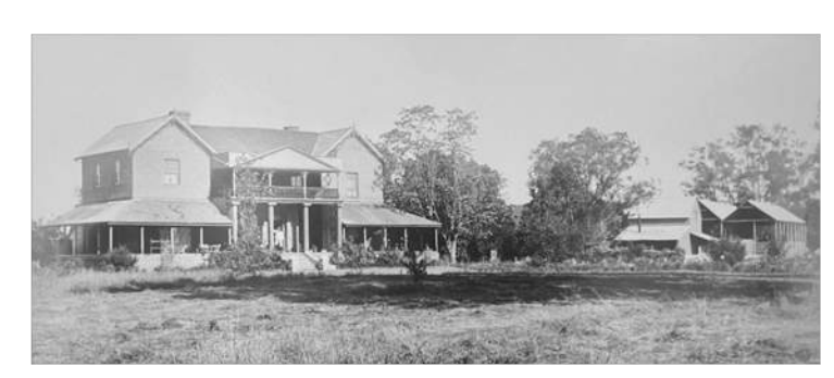
1899 Photo of Dardanup Park which is featured in the Homesteads and Houses section of the DHC website 1899 Photo of Dardanup Park which is featured in the Homesteads and Houses section of the DHC website

Please feel free to attend any of our monthly meetings. Details in the Whats On.