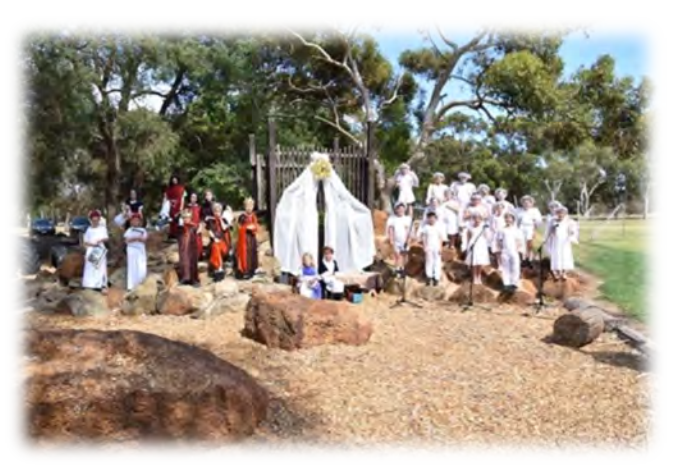
Year 1 Nativity Play Year 1 Nativity Play