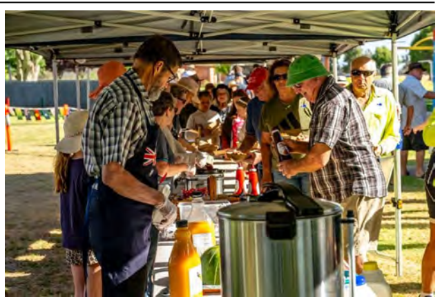
Scenes from the Dardanup Australia Day Breakfast