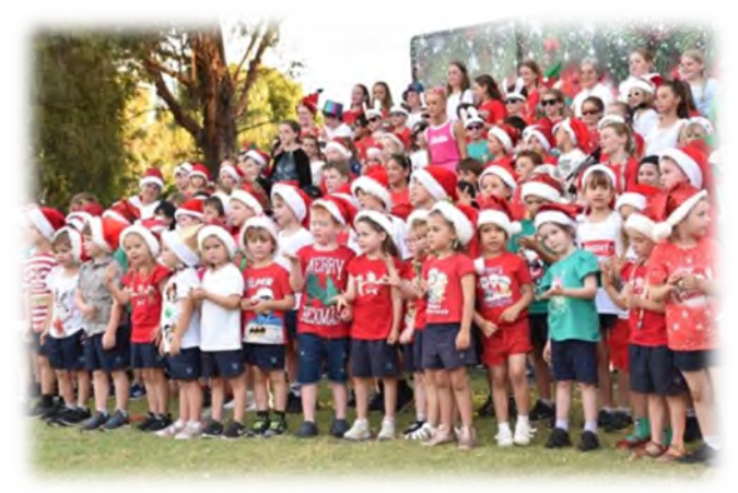
Christmas Concert 2023Christmas Concert 2023