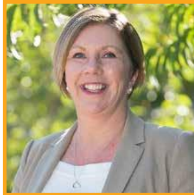
THE HON CATHERINE KING MP (INVITED)

Minister for Infrastructure, Transport, Regional Development and Local Government