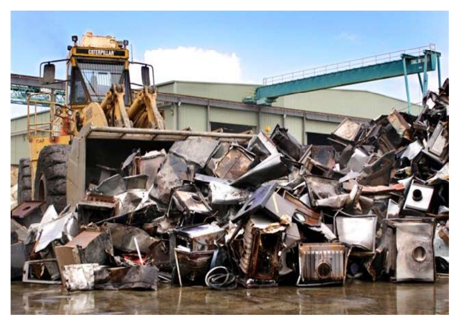
Wood heaters collected during the DEC Wood Heater Replacement Program 2006

The Perth Air Quality Management Plan was released in 2000, and outlines 12 initiatives to protect air quality in the Perth region. Initiative 9 is Haze Reduction, which includes several programs for the urban area aimed at decreasing haze occurrence. Programs include education campaigns of wood heater impacts, haze alerts and wood heater rebate programs. In recent years, the State Government has offered financial rebates to the public to assist with the replacement of wood heaters which could not legally be sold (see below picture).