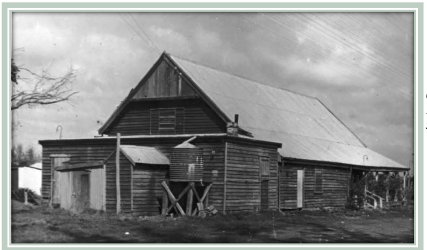
Original Dardanup Hall which was used from 1890 to 1956.